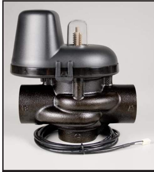
Order No. V3071 • NPT Order No. V3071BSPT • BSPT